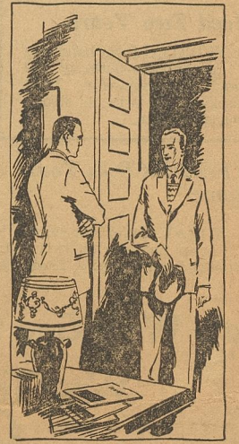
"What Are You? The Gardener?"

she started up again. A muffled knocking sounded at the terrace door, It was ominous and determined, and in a panic of terror she rose to her feet. If it was the law, come after