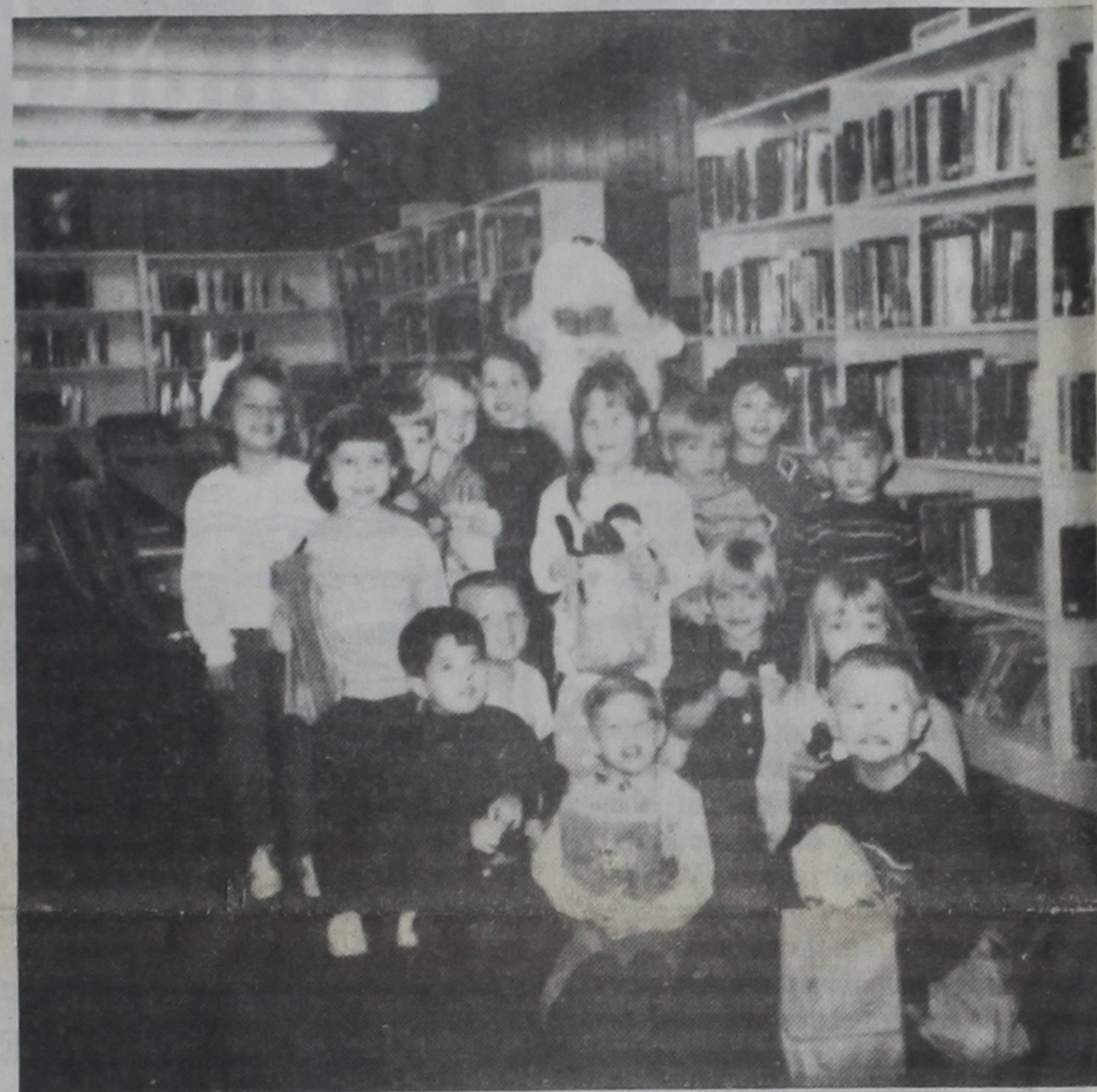
HO! HO! HO! — Santa Claus is pictured with pre-school "Learn About..." Program children.

Village Market, Lakeway Grocery, Food Plaza, and Skinny's will remain open during the holiday.