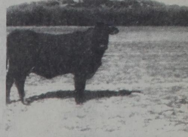
EAST CADDO PEAK Price 35¢