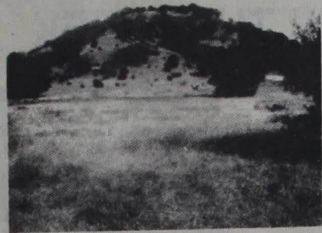
WEST CADDO PEAK Price 35¢