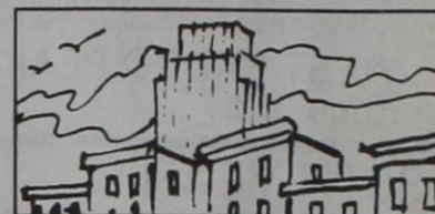
The first great skyscraper in America was the 47-story Singer Building, built in New York City in 1908.

For more information call (915) 672-5683.