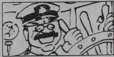
The first time a President left the country while in office occurred on November 9, 1906, when President Theodore Roosevelt sailed on the battleship Louisiana to visit the Isthmus of Panama and inspect the Canal.

Application forms and additional information are available from the congressman's Abilene office at (915) 673-7221.