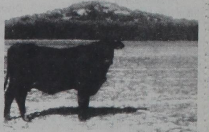
EAST CADDO PEAK Price 35¢