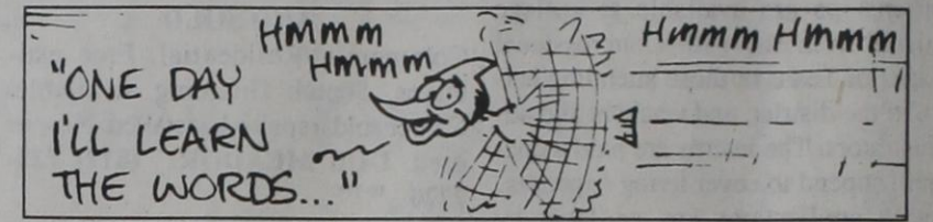
A hummingbird's wings move 60 to 70 times a second in the smallest species.

For more information, contact the Center for Rural Health Initiatives in Austin at (512) 479-8891.