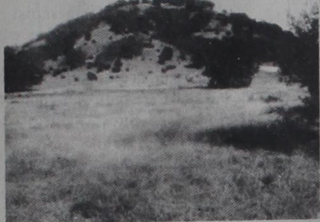
WEST CADDO PEAK Price 35¢