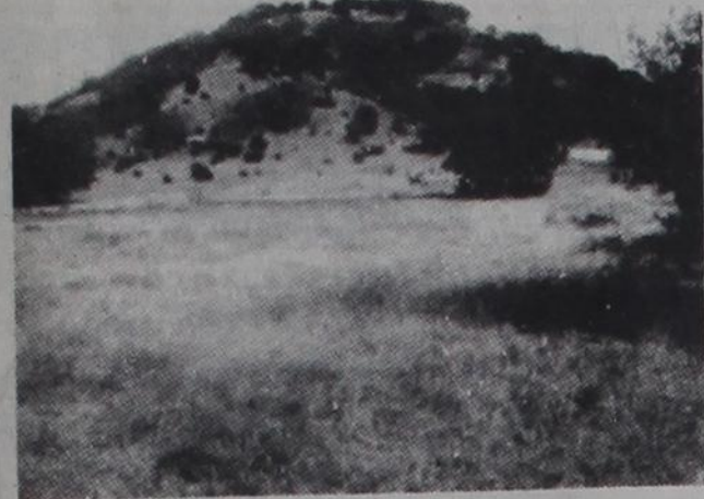
WEST CADDO PEAK Price 35¢