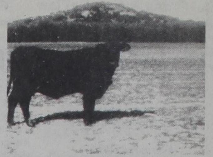
EAST CADDO PEAK Price 35¢