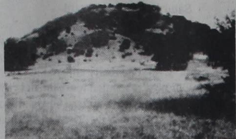
WEST CADDO PEAK