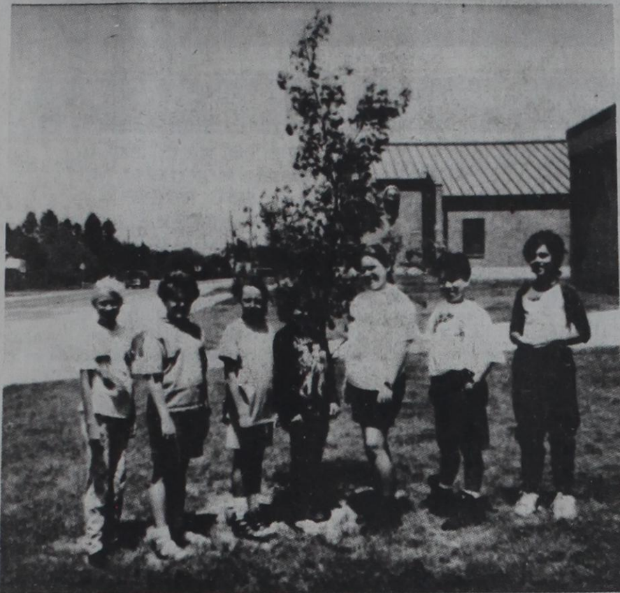
5th GRADE G/T ARE PROUD OF CROSS PLAINS CAMPUS. THE NEW ADDITION TO THE