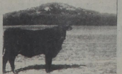
EAST CADDO PEAK Price 50¢