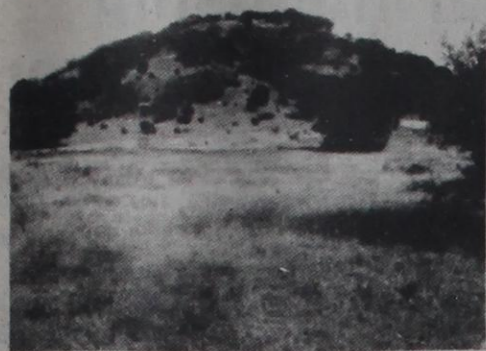
WEST CADDO PEAK