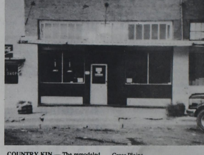
COUNTRY KIN - The remodeled store front compliments downtown

Living Water Ministries Fellowship will not be conducting services this Thursday, November 24, due to the Thanksgiving holiday.