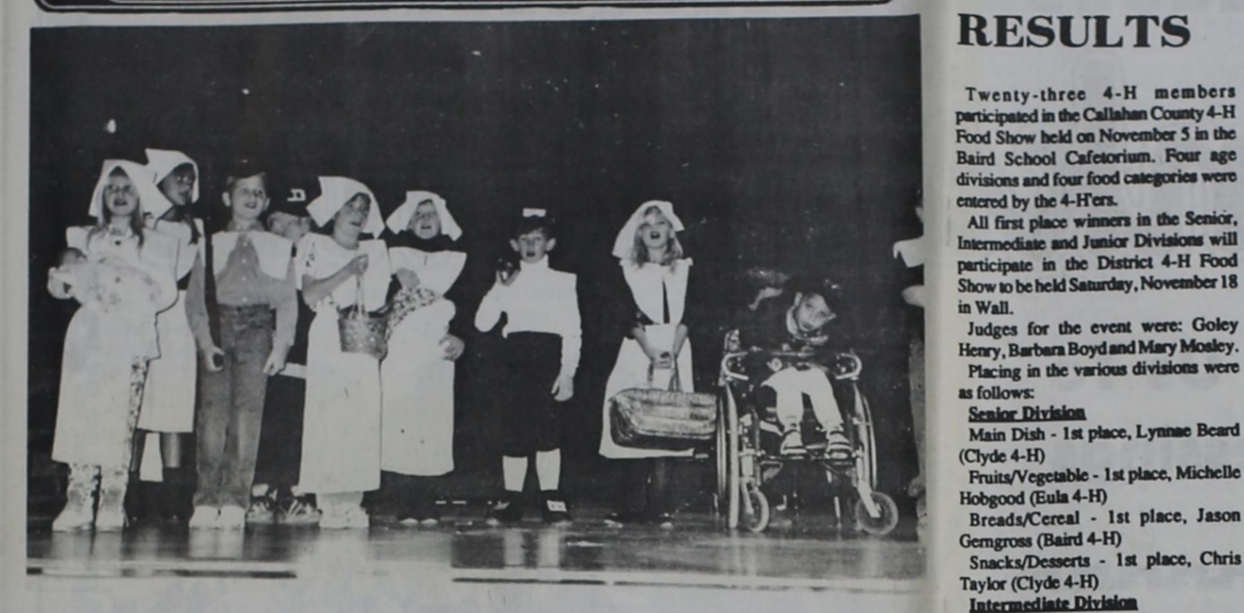
PILGRIMS-Second graders presented Thanksgiving play.