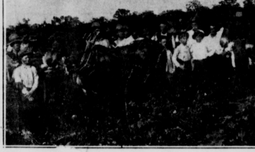
On August 6, 1910, Fort Worth Star Telegram printed the above picture with the following explanatory note: "The expectation of old timers who have been longing for a railroad at Cross Plains these 25 years were fulfilled Monday, August 1, when dirt was broken for the Texas Central extension."