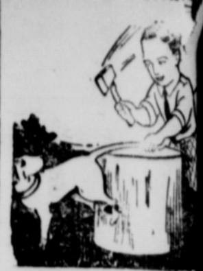
TO MAKE A LONG TAIL