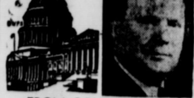
FROM CONGRESSMAN CLYDE L. GARRETT

HOUSING: The House Committee on Banking and Currency has approved a bill proposing an increase of the Federal Housing Authority's capital from $500,000,000 to $800,000,000 by sale of additional Housing Authority bonds and making the proceeds available immediately. A waiver for one year of the present requirement, that localities must put up 10% of the cost of a slum-clearance and low-cost housing project was written into the bill.