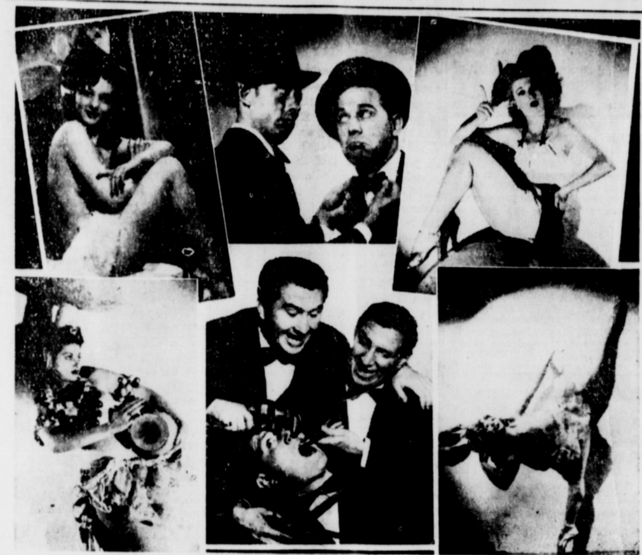
"Through these portals pass the world's most beautiful women." This sign has hung over the stage door of Earl Carroll's productions for years and has made him famous as the world's greatest picker of feminine beauties.