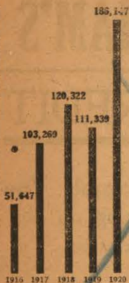
Chevrolet Sales Record

More than 4,000 Dealers, Retail Stores and Service Stations in United States and Canada