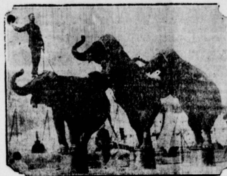
When Dailey Bros. Circus comes to town Thursday, April 22, the big beasts will help men erect the city of tents and later will be star performers in the center ring.