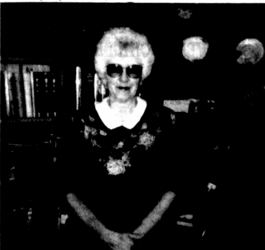
FEATURED BUSINESS OF THE WEEK, The Coyote Den Bookstore.

Deadline for submitting Santa letter is December 14, 1994 at 5:00 p.m.