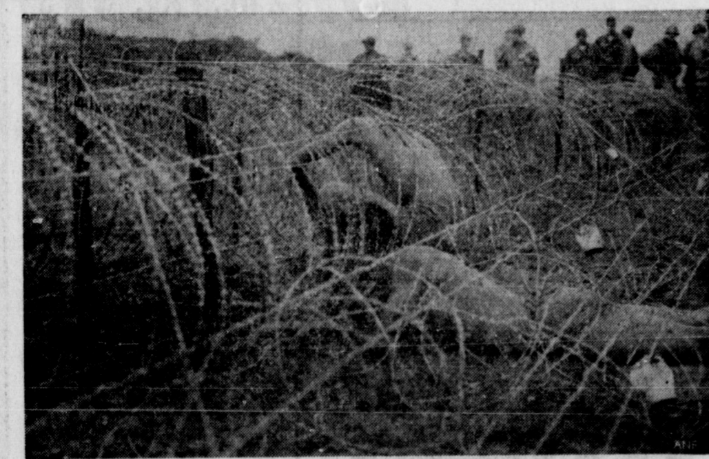
UNDER THE WIRE—Vietnamese soldiers attempt to infiltrate through concertina wire during testing of new techniques for stringing wire obstacles. The obstruction was designed and erected by the 26th Engineer Battalion of the Americal Division near Chu Lai, Republic of Vietnam. Tin cans attached to the obstacle sound an easily identified warning when jiggled.