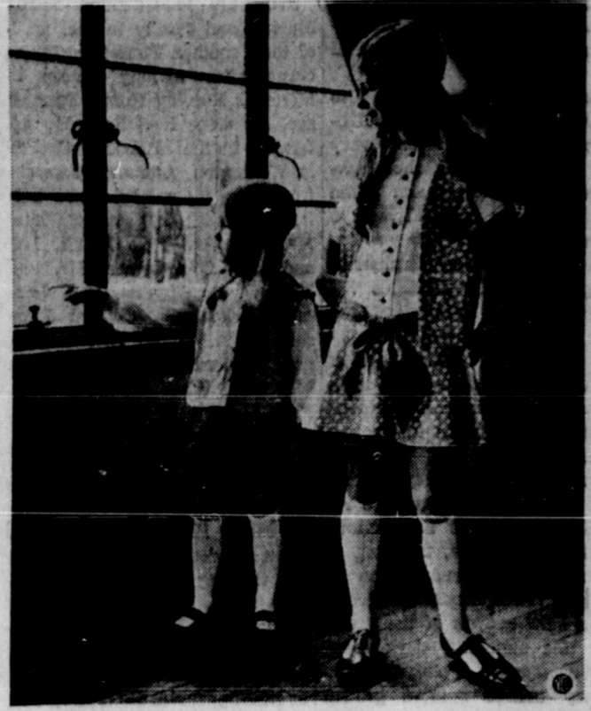
VESTED FASHIONS —The layered look is popular in children's wear this spring. Here, polka dots pop out on two vested cotton knit styles by Cinderella. Little sister's tank vest tops a panel-pleated skirt and long-sleeved blouse. Big sister's low-sashed dress takes a matching vest for a three-piece look.

The VA in fiscal year 1971 expects to increase treatment of in-patients by about 3,800 to more than 875,800 — a record high for the hospital program.