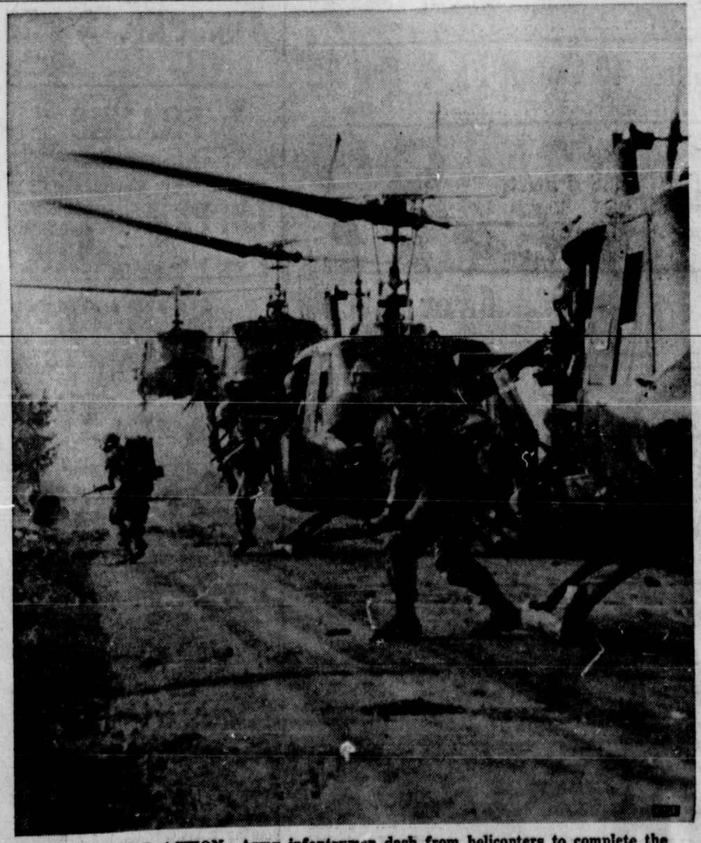
encirclement of a Viet Cong battalion during an operation south of Saigon, Republic