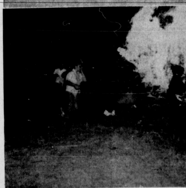
A big crowd of students and adults alike were out Thursday night for the big bonfire Pep Rally prior to the Bronco first game of the season.