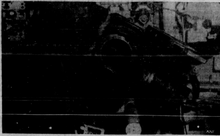
LOAD ONE — Preparing for a test firing at -65 degrees F, a civilian gunner loads an artillery piece in one of Aberdeen Proving Ground's environmental test chambers. Material is sent to the arctic, desert or tropics for testing by the U.S. Army Test and Evaluation Command only after some reasonable assurance has been obtained that it will function satisfactorily in the areas of its intended use.