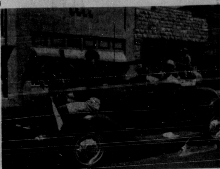
Scenes from the Parade and Barbecue July 4th.