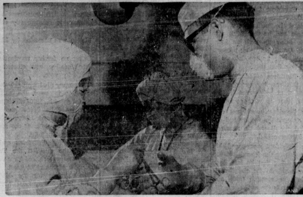
WHEN SPEED SAVES LIVES — Army nurses assist a doctor in the 93d Evacuation Hospital's operating room, Republic of Vietnam. The hospital is a MUST (Medical Unit, Self-Contained, Transportable) unit constructed of inflatable ribbed walls. Casualties carried by DUSTOFF may be flown directly to MUST hospital or any other medical treatment facility best equipped for the care required. The most important objective of DUSTOFF is to minimize the time between injury and medical treatment.