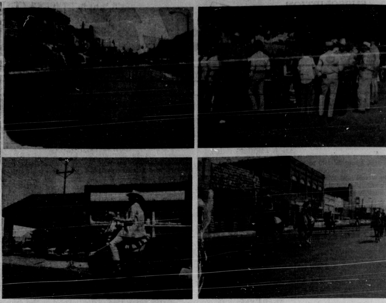
Scenes from the Parade and Barbecue July 4th.