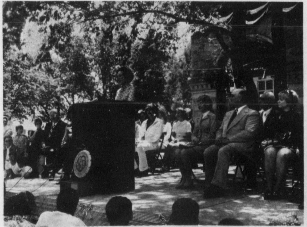
Mrs. Anne Armstrong, Counselor to President Nixon and chief Presidential advisor on the Bicentennial, addressed dignitaries and area residents in ceremonies at the Courthouse in Clarendon prior to presening Bicentennial Flags and Certificates Saturday afternoon, May 11.