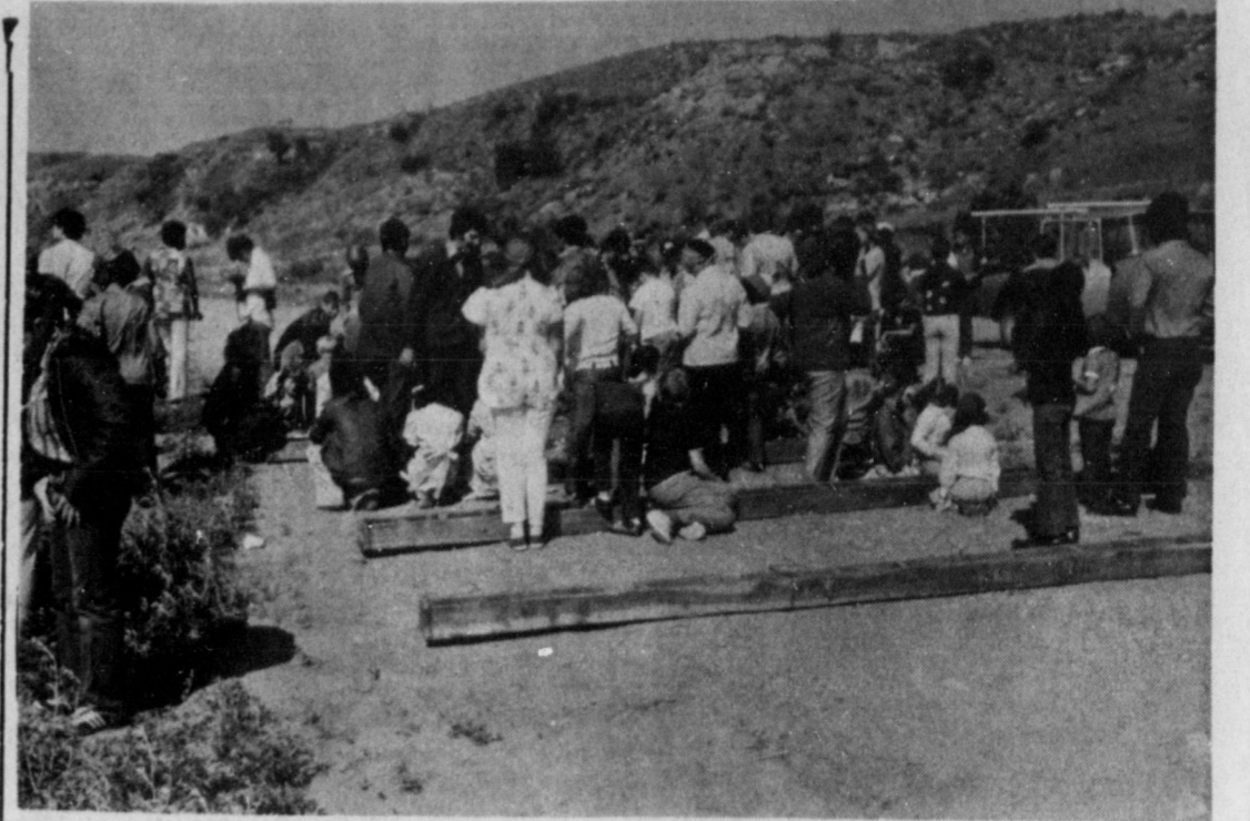
Shown are only a few of those making brick at the Continental Youth Congress at the Valley of Ciboli Saturday.