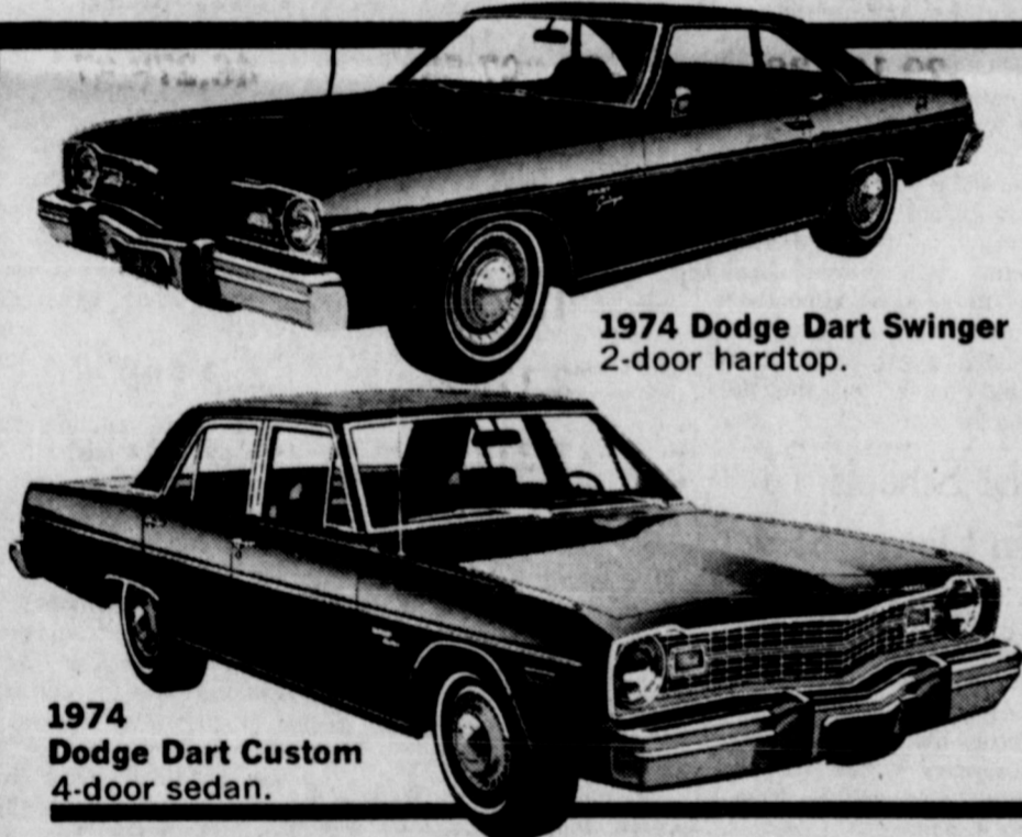
1974 Dodge Dart Swinger 2-door hardtop.