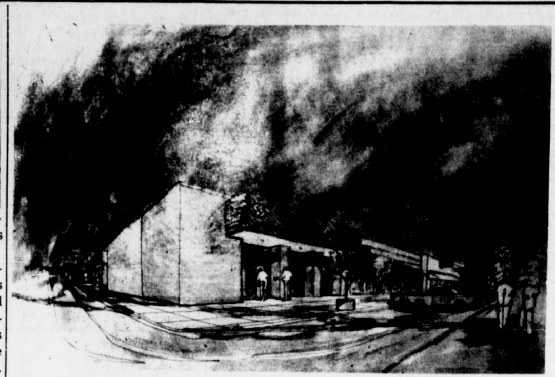
This is an Architect drawing of the planned remodeling and expansion of the Security State Bank at Hedley. Bank space will be doubled and the entire structure will be most modern in every respect.