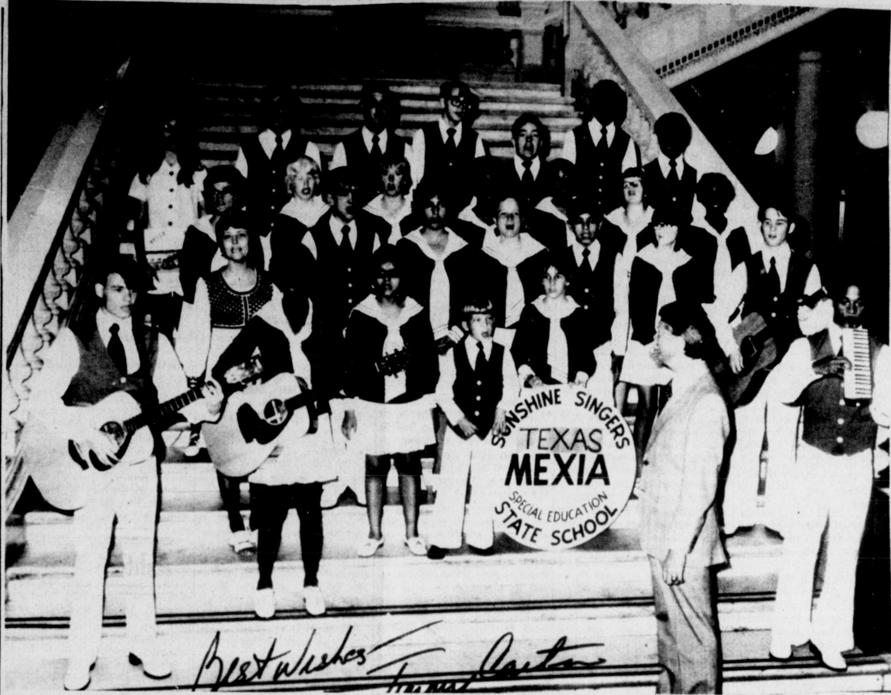
The Sunshine Singers, a group of 40 to 45 adults and children from the Mexia State School for Retarded Children will present a Concert at the First United Methodist Church Saturday, February 16, 1974 at 8 p.m. The public is invited to attend. There will be no Admission charge.