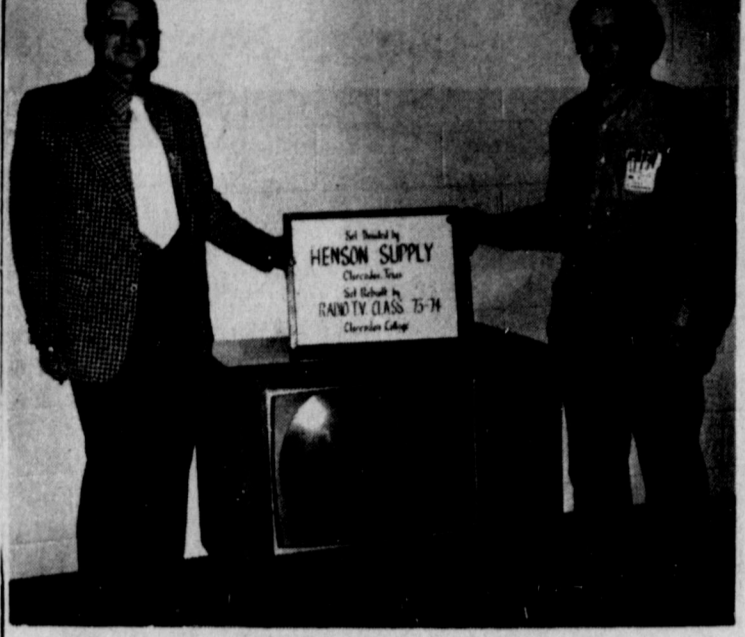
CLARENDON COLLEGE RECEIVES T.V. A used color television was recently presented to the girl's dormitory at Clarendon College by Henson's of Clarendon.

The Department of Agriculture leads the enrollment with 39 majors under a degree program and 30 in the Vocational-Technical program.