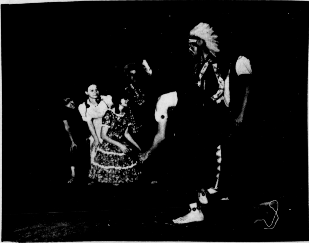
A scene from "Annie Get Your Gun" to be presented in College Fine Arts Center April 11-12.