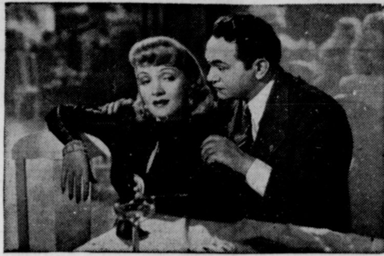
MANPOWERFUL PAIR—Marlene Dietrich works her particular kind of manpower on Edward G. Robinson in the Pastime's new hit—entitled—you guessed it—"Manpower." George Raft is co-starred.

Cotton picking is expected to begin at Brice next week, according to reports reaching here today.