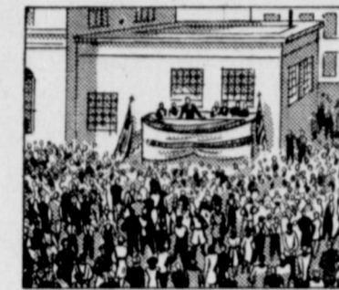
1. Thousands of employees, only ten days after war declaration, gathered in mass meetings in most major G-E plants to pledge all-out war effort!

General Electric men and women—thousands of them! Four typical scenes showing the spirit with which they are tackling the grim job of producing for war!