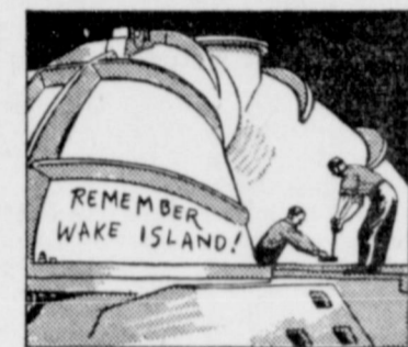
3. A sign chalked by a G-E workman on a big machine being built for war. The sign carried this challenge to fellow workers: "Remember Wake Island!"