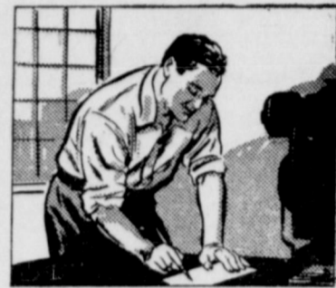
2. Almost 85 per cent of all General Electric employees signed up to buy U. S. Defense Savings Bonds totalling more than $20,000,000 a year!