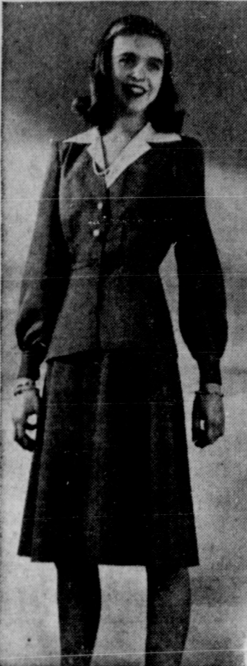
THE April issue of Good Housekeeping Magazine presents this dependable, two-piece, rayon and wool gabardine jacket dress with white rayon detachable gilet. It comes in navy, natural, and soft rose—colors you can wear the year round.