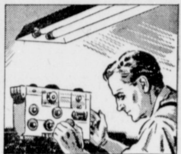
4. And day and night—around the clock—G-E workmen keep steadily at the most important job of building weapons and supplies for U.S. fighting men!

General Electric believes that its first duty as a good citizen is to be a good soldier. General Electric Company, Schenectady, N. Y.