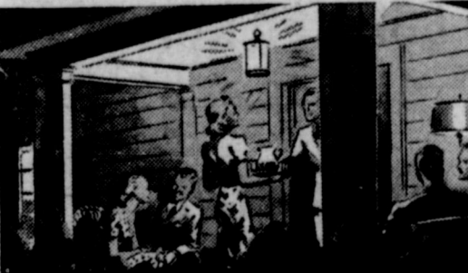
3. Twice the light. No blackouts here! Today you can get twice as much light as you used to, for the same money. Electricity today costs only about half as much. (Light bulbs are twice as efficient, so you get four times as much today for the same money.)