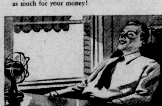
4. Twice the comfort. Constant research is developing new and cheaper ways of using electricity. Air conditioning this past summer reached more homes than ever before, bringing cool comfort at small cost. Other usages are being constantly roved at no extra cost to you!

Credit for the steadily improved service to you at steadily reduced rates is due the trained and experienced men and women of this organization. They have devoted many years to the highly technical problems of electric generation and distribution . . . all without interruption and at low cost.