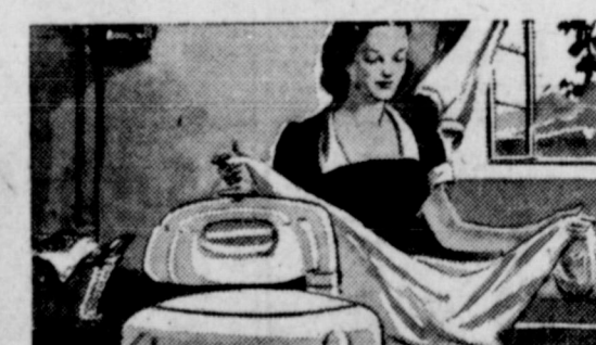
2. Twice the labor saving. Ask the woman who owns a washing machine what electricity has done for her! At present-day low rates, you can afford to use most all the modern appliances. Today electric rates are only about half what they were 10 to 15 years ago. You get about two or three times as much for your money!