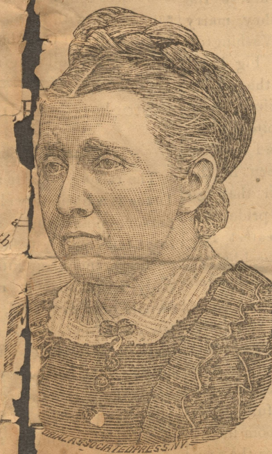
Julia Ward Howe

Confluence, Pa, October 29.—A terrible disaster occurred near Brooks tunnel, on the Baltimore & Ohio railroad, yesterday morning about nine o'clock, resulting in the killing of five men. The railroad company have been strengthening and widening the tunnel, and some distance out a magazine had been erected which was stored with 1,200 pounds of dynamite which was to be used for blasting. About the hour named, a freight train had just passed through the tunnel and was side-tracked to allow a passenger train that was overdue to pass. Four of the crew walked back to the vicinity of the magazine and were engaged in conversation with the watchman, when the people in the vicinity were startled by a terrible concussion. Houses for fifteen miles around were shaken to their foundations, and windows for a distance of seven miles were shattered. Horror-stricken, the people ran from their homes. Investigation showed the dynamite had exploded with fearful effect. Everything in the vicinity gave evidence of its terrible force; trees were uprooted, large rocks torn asunder and telegraph poles for half a mile prostrated. Nothing remained of the magazine, while the five men who were present were missing. Por-