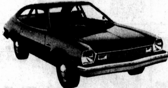
FORD PINTO. America's best-selling small car. Packs a bigger engine, wider stance and more road-hugging weight than the leading imports. Yet it's still sticker-priced less than many imports.