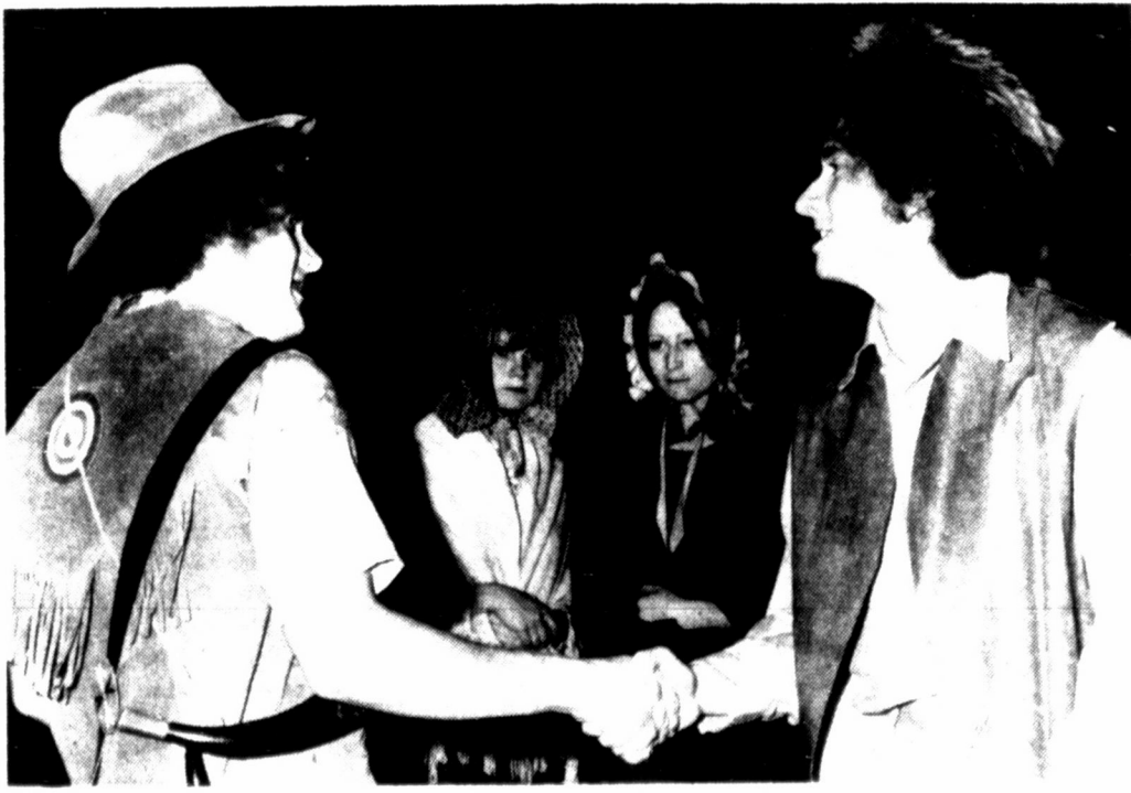
DAMES OF THE WEST -- The women's point of view will be featured in Clarendon College's spring production "The American Dame," due for a two-day run April 29-30. As the American frontier was opening, this view was one of weak submission before their male counterparts. Here, two early