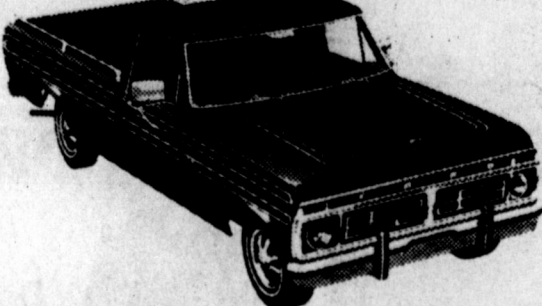
FORD EXPLORER SPECIAL. Now, get up to $201 off on limited edition Ford Explorer pickups, specially equipped with air conditioning, tinted glass, automatic transmission, power steering, and more. One tough truck—at a hard-to-beat price!