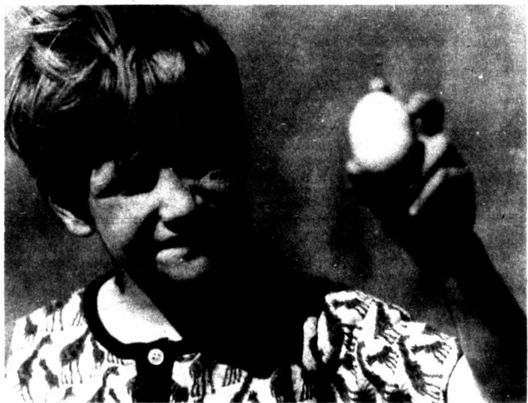
EASTER EGGER -- Kids and eggs are a part of the annual Easter celebration. In Clarendon, the Calvary Baptist Church hid several hundred eggs and turned children of the congregation loose to