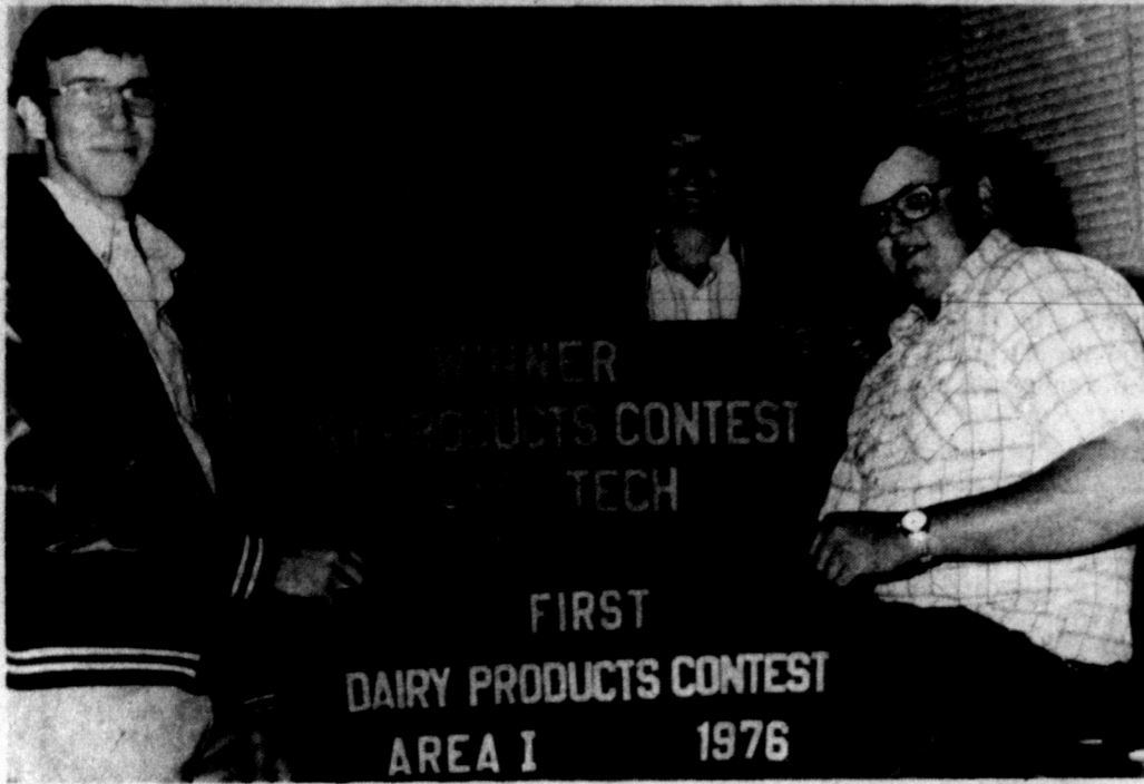
DAIRY JUDGING -- Double winners for Area I and the Texas Tech Dairy Products Judging Contest were these Clarendon FFA members at competition April 10 in Lubbock. Team members