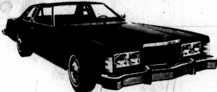
FORD LTD. Smooth-riding, quiet, luxurious. Plenty of room for six adults. And with its optional trailering equipment, LTD is rated to tow a half ton more than its biggest competitor.