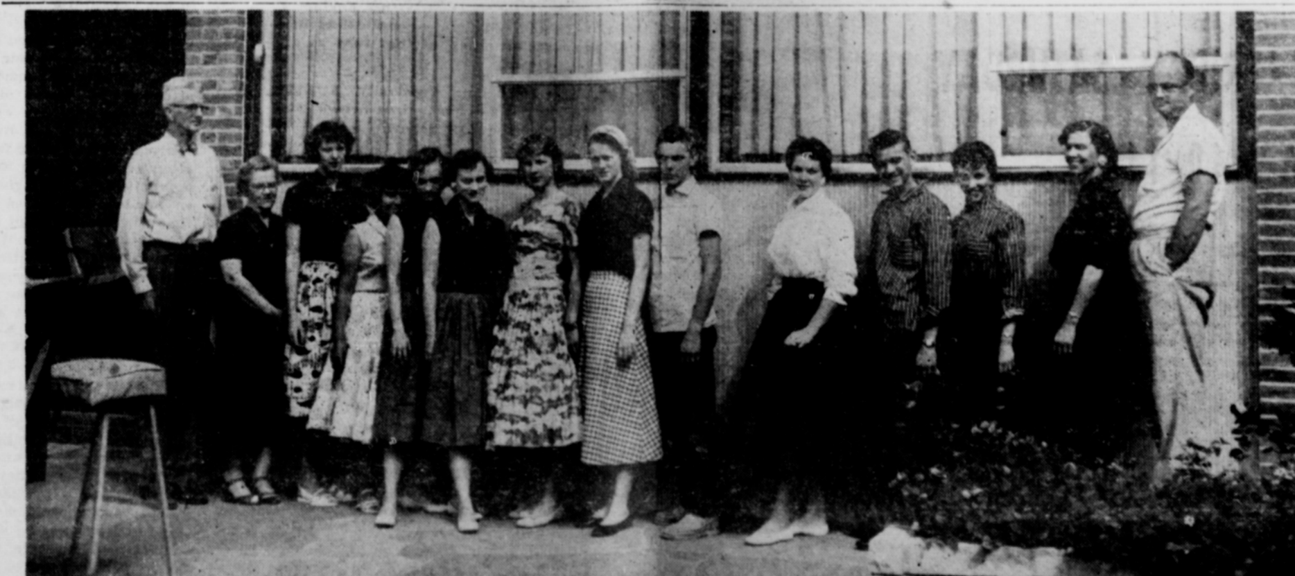
THOSE WERE HAPPY TIMES — Putnam high school graduates recently added another happy memory to their final semester of school. It was a trip to the Gulf of Mexico and a most enjoyable three day stay at the Jack Tar Hotel in Galveston. Pictured above are those who made

Deadline for filing for county and state offices in time to have name printed on the official ballots to be used in the July primary, passed at midnight Monday, May 7.