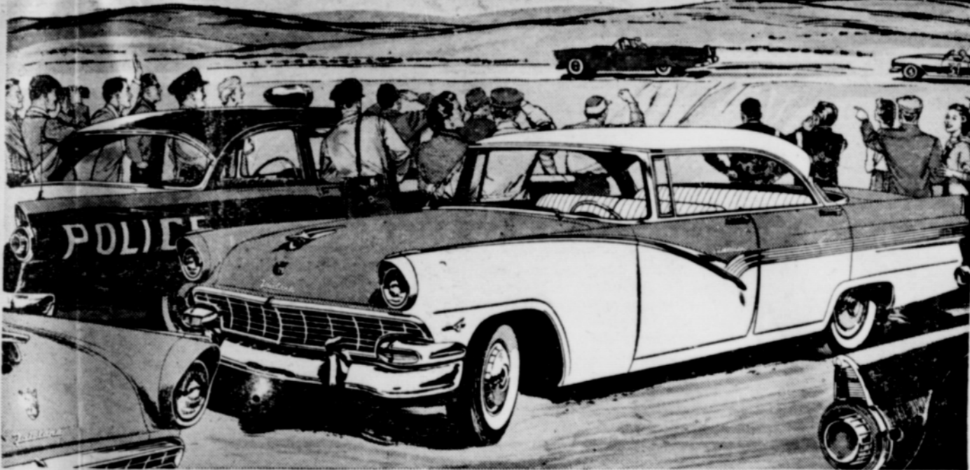
The Thunderbird's own record-setting 312 cubic inch engine can now be yours in most Ford models.