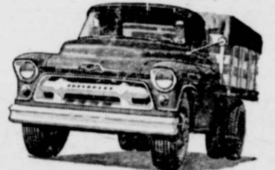
New Middleweight Champs

High-powered V8's—standard in heavy-duty jobs! You get the big new 322-cu.-in. Loadmaster V8 in 9000 and 10000 series trucks. The Taskmaster V8 is standard in other L.C.F. and heavy-duty models. In lightweights and most middleweights, V8's are extra-cost options.