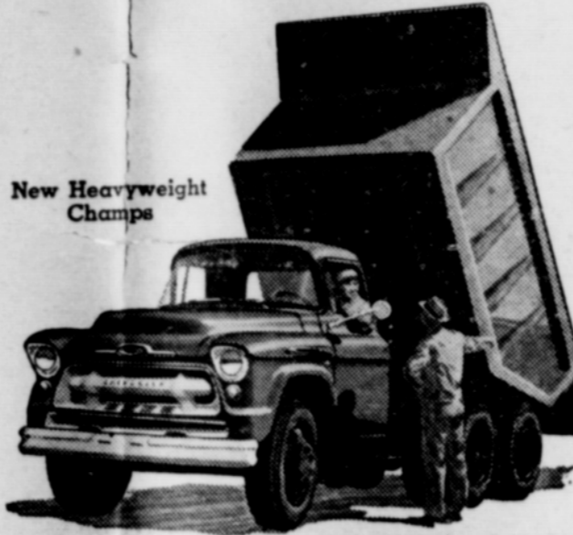
New Heavyweight Champs