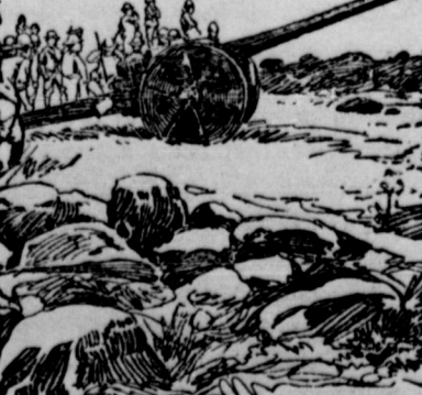
ONE OF THE TERRIBLE'S 4.7 NAVAL GUN IN CHINA.

A brilliant dash against a large force of Chinese at Tien Tsin was made this