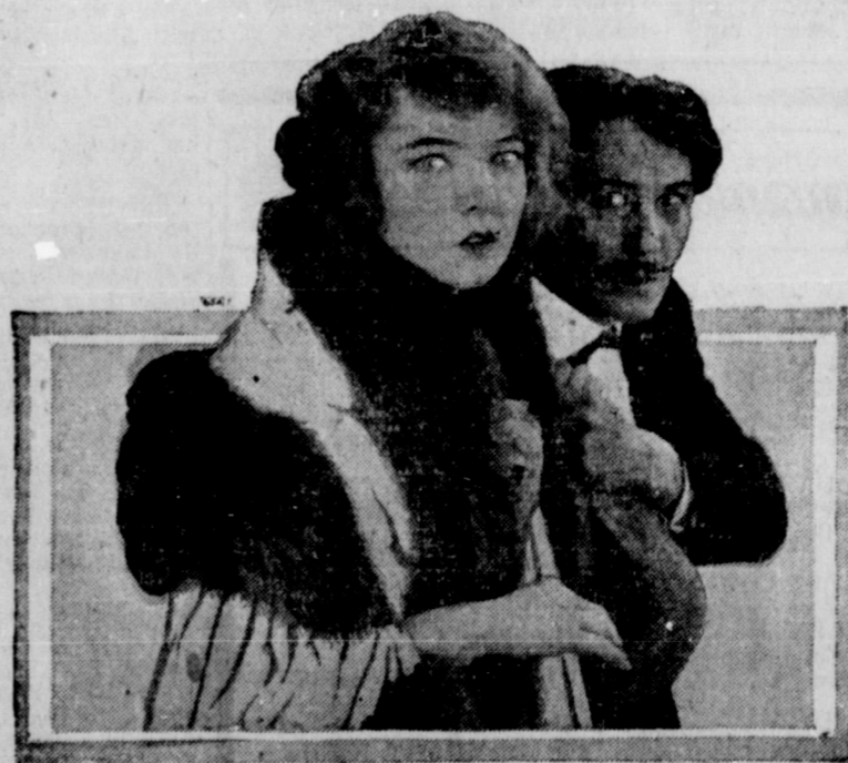
LILLIAN GISH and HENRY VALTHALL in D.W. GRIFFITH'S "The Great Love" An ARTCRAFT Picture

The greatest picture since "THE BIRTH OF A NATION." Practically the same actors are in this wonderful picture as were in "The Birth of a Nation."