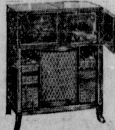
THE ALLEGRO (left), dark mahogany style, proportioned for today's home; interim record changer. $179.95