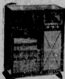
THE NEW MINSTREL (right), handsome contemporary style, standard record changer. $149.95

A Model for Every Purpose—a Radio for Every Room