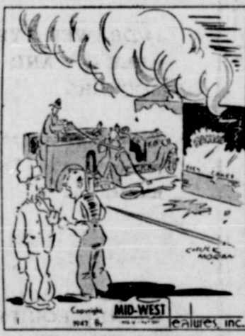
"Flaming Plum Puddin' Bak!"

WHITSELL DRUG Sandwiches Soda Fountain Phone 81-J Clarendon, Texas