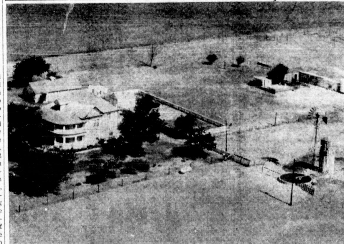
MYSTERY FARM NO. 49 —This is the Leader Mystery Farm of the Air for this week. Rules governing this guessing contest and prizes are as follows: 1st in town and first living and receiving their mail in country to identify the mystery farm will receive a one year subscription to the Leader. The fifth to identify the farm, both town & rural will receive a free ticket to the Mulkey Theatre. The owner or tenant identifying his farm at the Leader office will receive a mounted picture free. Hours for making identification are 8 to 12 and 1 to 5 starting Thursday morning. Last weeks Mystery Farm is identified on another page of this week's issue of the Leader.