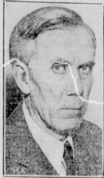
Led by its new chairman, Representative Robert Crosser, above, the House Steering Committee has decided to jam through no more legislation this session without debate or amendment.

WASHINGTON, June 8.—(AP)—President Roosevelt today called in House Democratic leaders for a decision on the disputed veterans economies with a determination to end this row immediately in hope of making it possible for Congress to adjourn by the week-end.