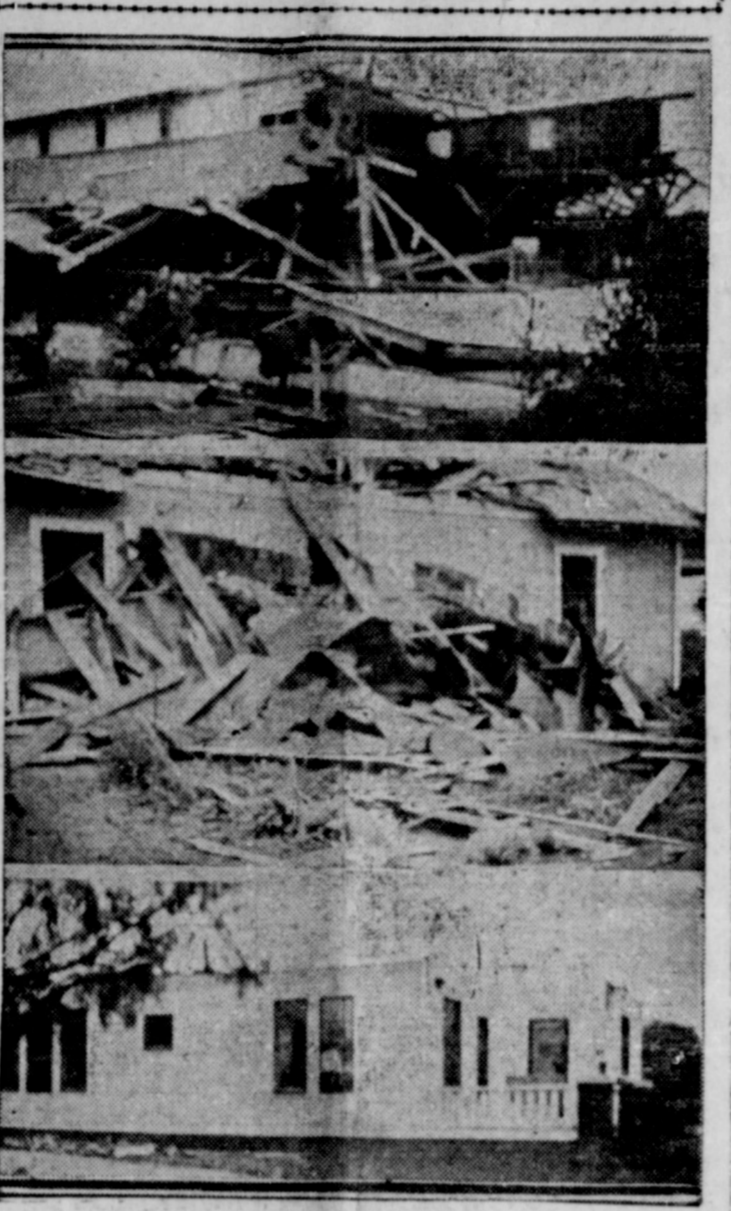
Three scenes of wreckage caused in Brownwood by the Wednesday night storm are shown in the above pictures. The pictures were made early Thursday morning following the storm Wednesday night...