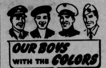
OUR BOYS WITH THE COLORS