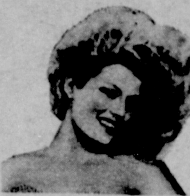
Lovely Rita Hayworth in Columbia's Magical Musical "Cover Girl".