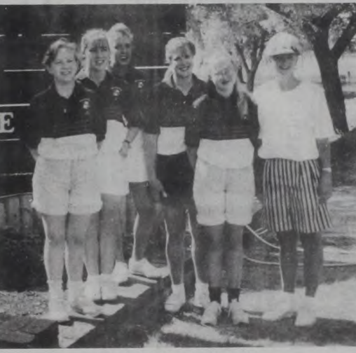
LADY HORNETS GOLFERS