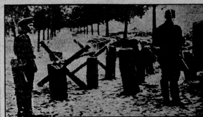
DANZIG-RADIOPHOTO-With the German fighting machine striking first against Poland, this radiophoto shows an anti-tank barricade, set up by the Polish on the Danzig border.

tition of plastics with their new plastic safety glass that will be used this year. This glass will bend and not break if hit hard.