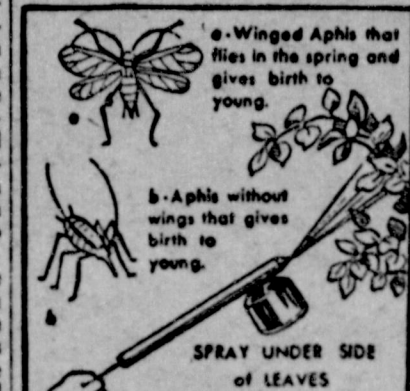
How Can Plant Lice Be Controlled?

The plant louse or aphid, as we have said, operates by sticking his snout into the tender tissues of any part of the plant he can penetrate for the purpose of withdrawing sap. There is in the saliva of the plant louse an irritating substance that will almost ruin a crop.