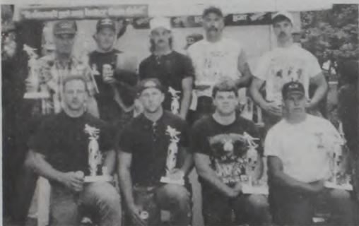
TUG-OF-WAR CHAMPIONS - T & D Construction, above, and, Below, The Hammers.