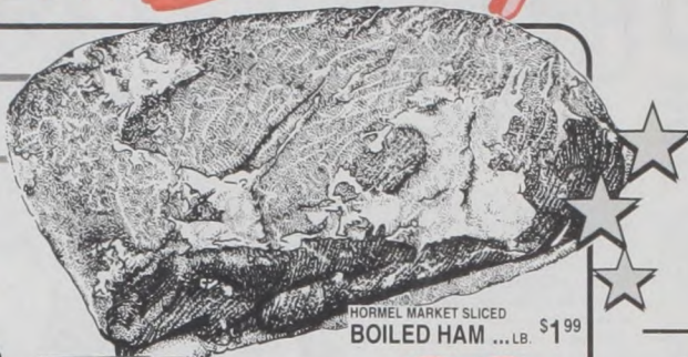
HORMEL MARKET SLICED BOILED HAM ... LB. $1.99