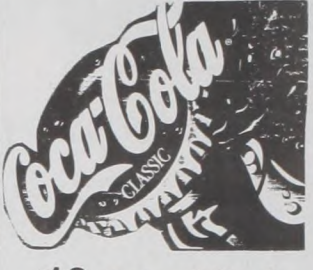
12 oz. 12 pk.