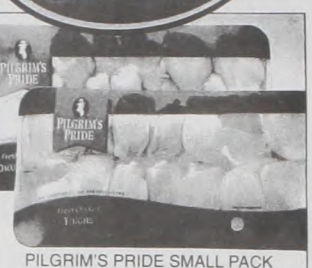
Drumsticks or Thighs