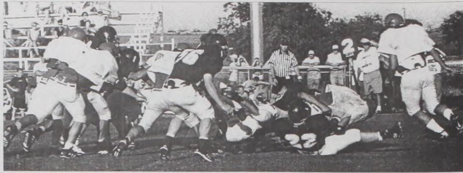
enster Hornets and the Lindsay Knights scrimmage at Stadium last Friday evening. Running three "teams"