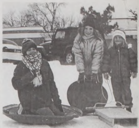
Snow and ice earlier in the year brought out the sleds.