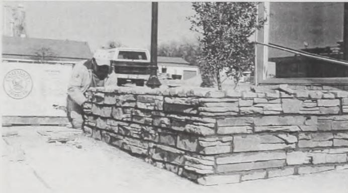
Keep Muenster Beautiful award money was used on Hwy. 82 and Main Street project.