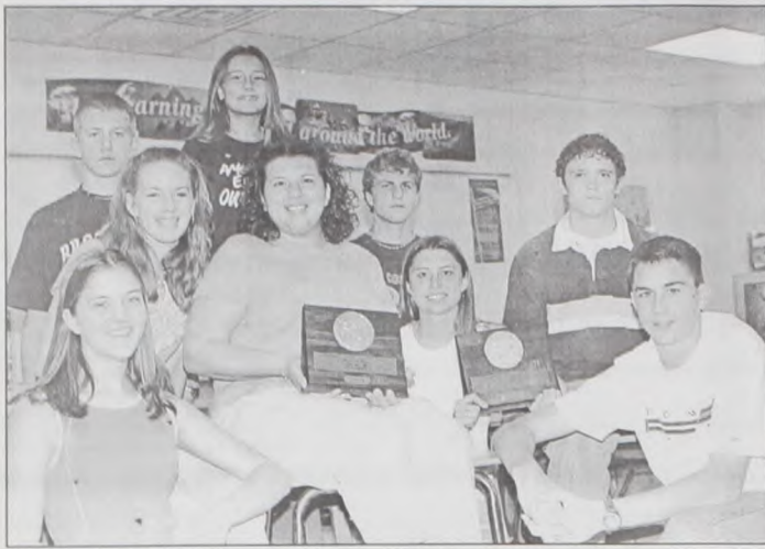
Muenster High School students brought home state UIL academic awards.