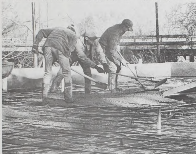
Muenster Park gets addition of New Stage.