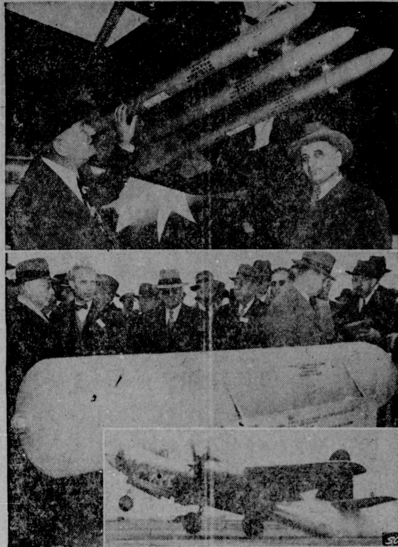
Photos made at Patuxent, Maryland, with cooperation of U.S. Navy.