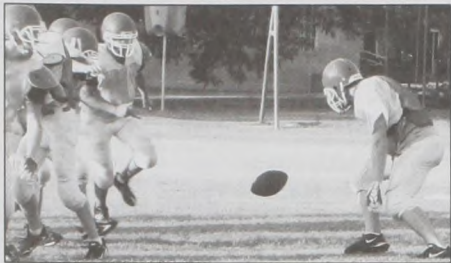
The Tigers of Sacred Heart Catholic High School continued their morning workouts earlier this week, before classroom time took over Thursday.