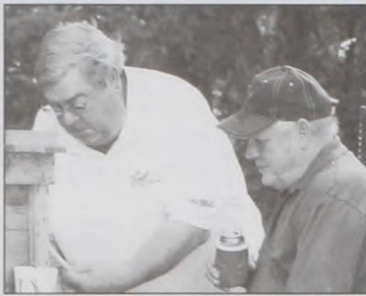
Food, fun, and fueling the firemen's new truck fund headlined the Muenster Volunteer Fire Department's Annual Barbecue and Auction Saturday evening. More than 900 people came out to eat barbecue and spend an evening with family, friends, and neighbors.