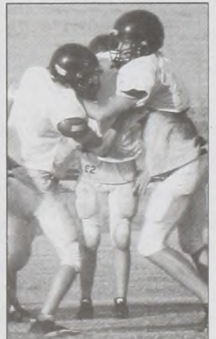
The Lindsay Knights worked on blocking during Wednesday morning practice.

The two most important words: "Thank you" The most important word: "we" The least important word: "I"