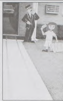
Having fun while learning at the First Baptist Church's Vacation Bible School this week.

Muenster 4-H will meet at 6 p.m. on the second Monday of each month from September through May. The organization provides many opportunities for its members.