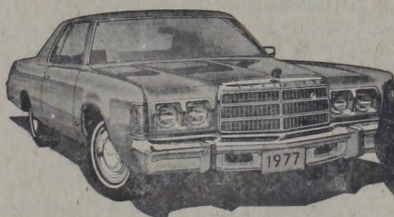
CHRYSLER NEWPORT FOR TEXAS-SIZE ROOM, HERE'S THE CAR TO CHOOSE.

Lots of room like you've come to expect. Plus, Newport is backed by Chrysler engineering. With power steering and brakes, TorqueFlite automatic transmission and Electronic Lean Burn System — all standard.