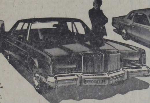
CHRYSLER NEW YORKER THE LUXURIOUS CHOICE. LUXURY AND TEXAS-SIZE ROOM.

Lots of room like you've come to expect. Plus, Newport is backed by Chrysler engineering. With power steering and brakes, TorqueFlite automatic transmission and Electronic Lean Burn System — all standard.