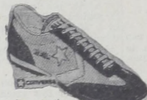
styles similar to picture

Closeout on Several Styles of Converse and Puma Shoes 25% off the regular price