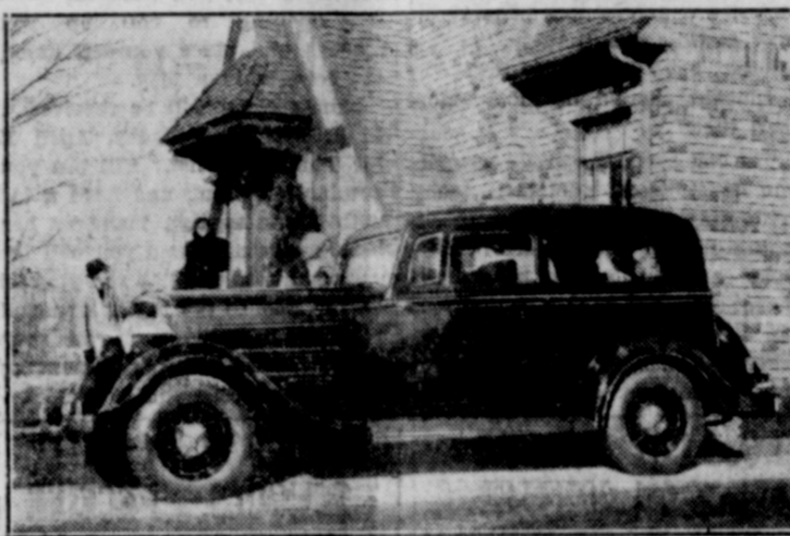
NEW 1934 DODGE COACH

Automatic Clutch, Free Wheeling, 7-Point Ventilation, Individual Wheel Springing