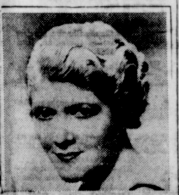
By JEAN DIXON (Screen Actress)

Too much make-up is far worse than too little, particularly for those who are not the ingenue type. Make-up for the street should be used less freely than for evening.