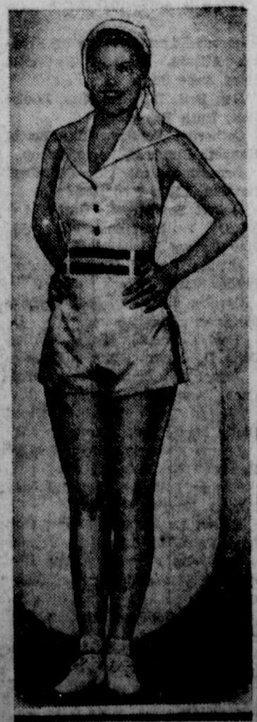
SEARCH FOR BEAUTY