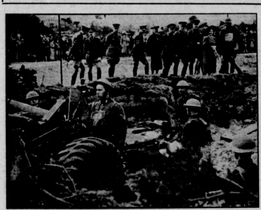
Their Majesties the King and Queen paid a visit to Aldershot, Hampshire, recently to watch Army exercises. Photo shows: The King and Queen, accompanied by officers, watching a camouflaged gun-team in action at Aldershot.