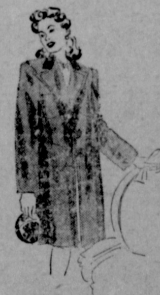
A BOXY COAT for all ages, with a black velvet collar, three buttoned fastening, and big semicircular stitched pockets. The long straight lines make it wearable for all occasions.

You couldn't choose a better time to buy your winter coat — than a day on which you've time to shop leisurely, cautiously, critically. And you couldn't want a better selection than ours — featuring fine fabrics combined in the season's most dramatic, well tailored styles.