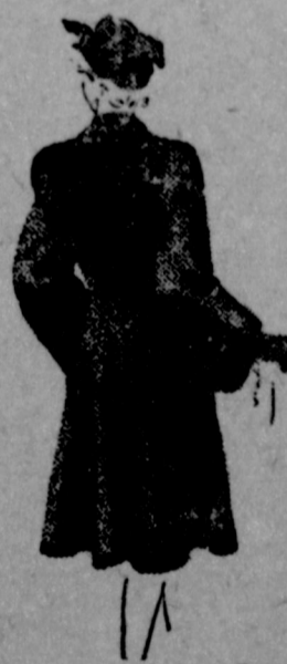
BOUCLE COAT fitted to the waist, then falling in graceful folds in the full skirt — full collar and bell sleeves show the designer's extra special treatment.