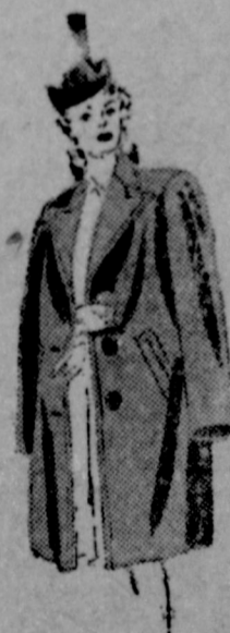
IT'S A GREAT CAMEL'S HAIR COAT with three big sporty buttons to fasten you inside its snug warmth. Deep slash pockets and man-tailored lapels make it the traditionally desirable coat it is.