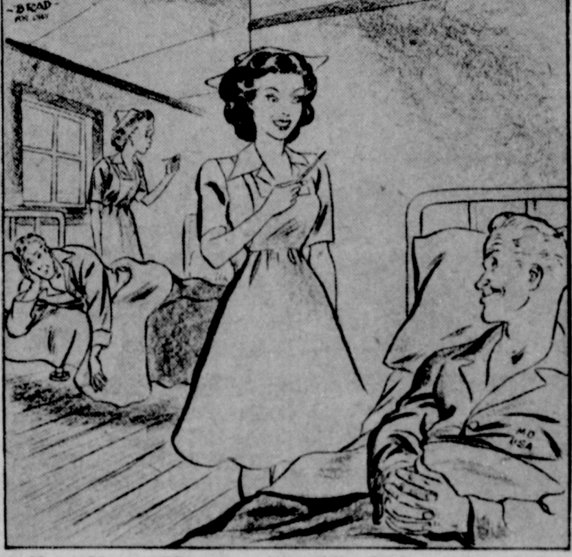
News Note.—"Country girls make the best nurses," say medical authorities, "because they know how to get up in the

high score award went to Mrs. personal losses or inconvenience