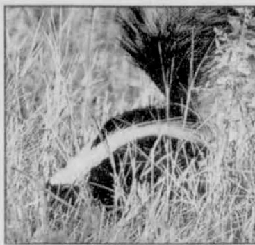
Lake Level—November 13, 2000—48.58 feet

That's a drop of 4 inches from last Monday.